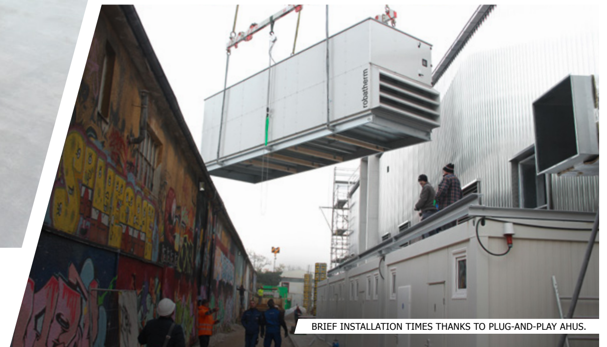
BRIEF INSTALLATION TIMES THANKS TO PLUG-AND-PLAY AHUS.

The successful composition of all processes creates efficiency and the basis for delivery dates that you can rely on.