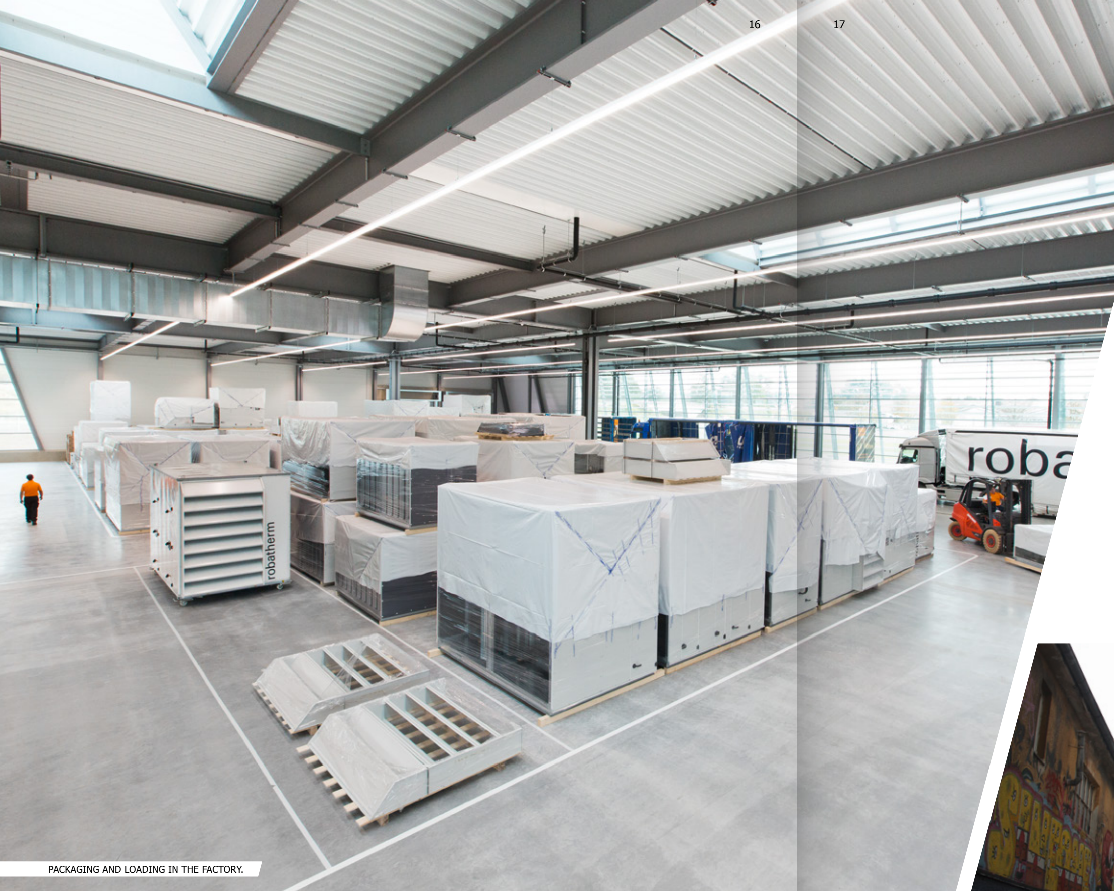
PACKAGING AND LOADING IN THE FACTORY.