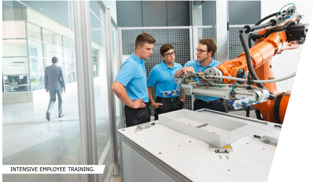
INTENSIVE EMPLOYEE TRAINING.